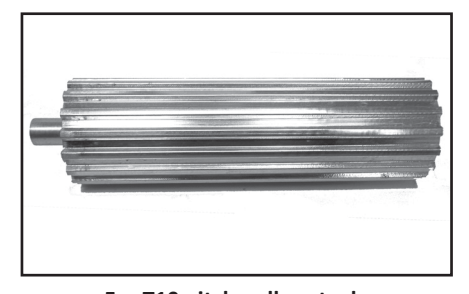
For T10 pitch pulley stock, see page 336.